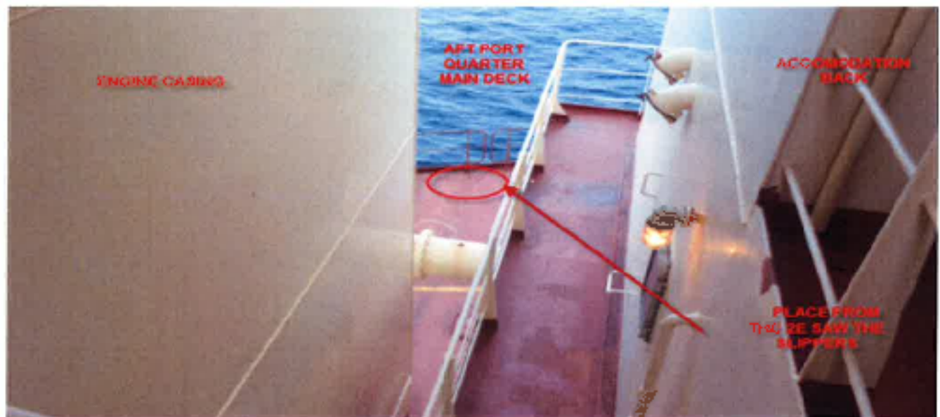
Figure 2: Location where 2 nd Engineer saw the slippers