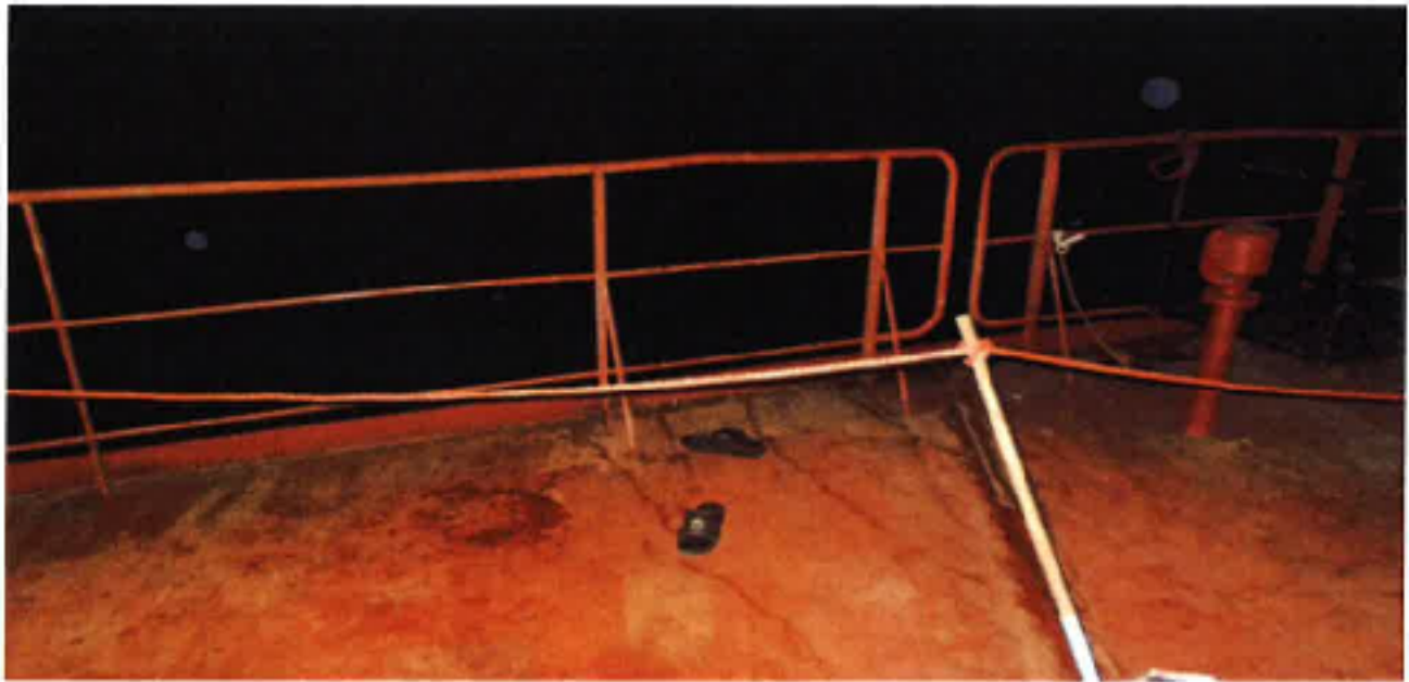
Figure 1: Electrician's Slippers on deck. Photo taken by crew at the time of incident